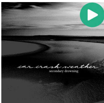
Secondary Drowning (2018), CD & Vinyl