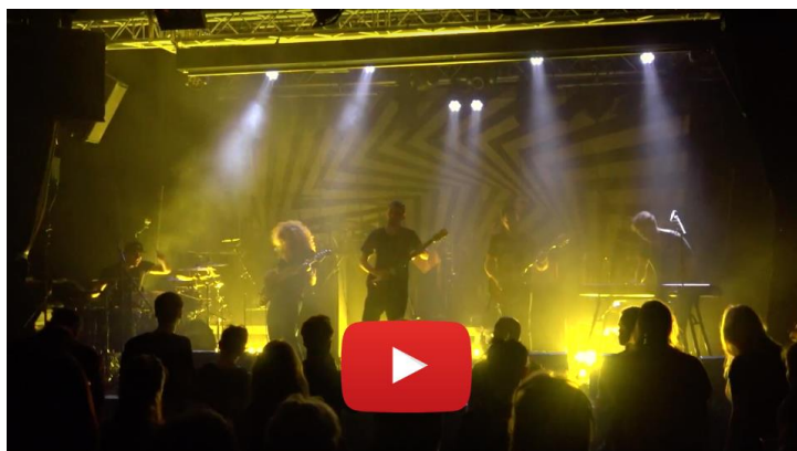
carcrashweather live | bergmal Festival 2018