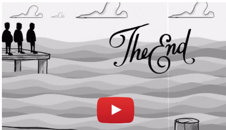
carcrashweather – The End